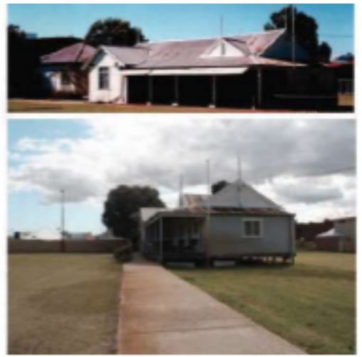
Figure 15. Indicative potential location for the former Victoria Park Croquet Club

Below is an ariel shot of the possible site where the building may be placed